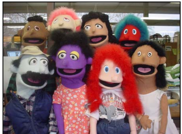
Puppets made with the One Way Street pattern.