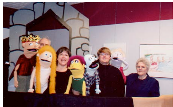
Performance of Rapunzel on Day of Puppetry