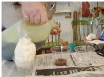
Mixing the 2 liquids