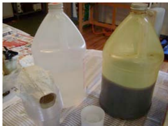
Alupalite consists of 2 liquids