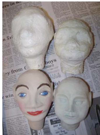
Heads sculpted, cast, and painted by Beulah