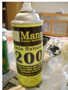
The mold needs to be sprayed with a release spray before pouring the Alupalite in. No one from our guild is going to the