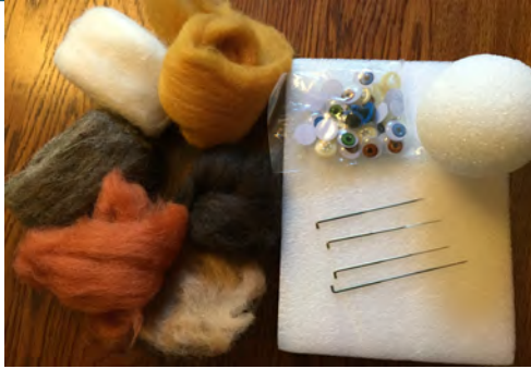
Supplies: wool roving, needle felting needles, foam pad, Styrofoam ball, eyes