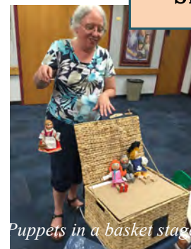
Puppets in a basket stage