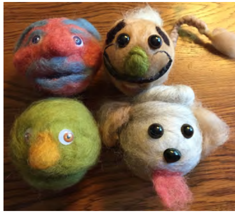
Sample heads, each made in about 1 1/2 hours